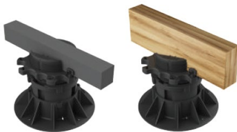
15mm - 60mm DuoLift Cradle